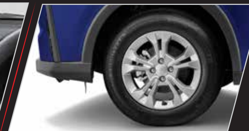
16-inch Alloy Wheels (5-spoke)