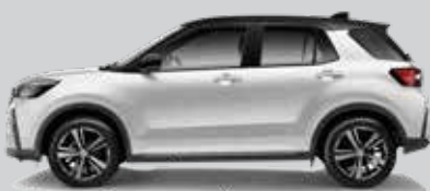
Pearl Diamond White*