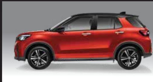
Differences from H