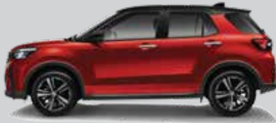
Pearl Delima Red*