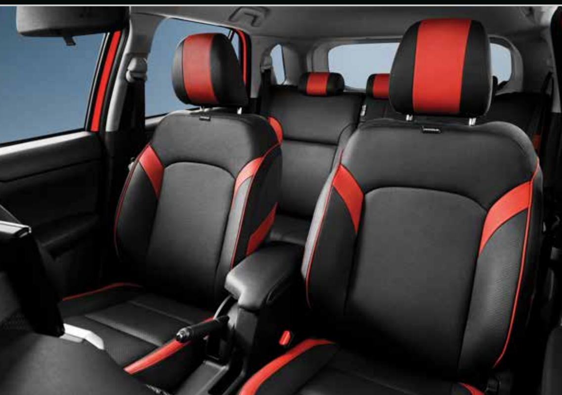
Spacious Interior for comfortable ride

Ergonomically designed to accomodate diverse requirements and needs.