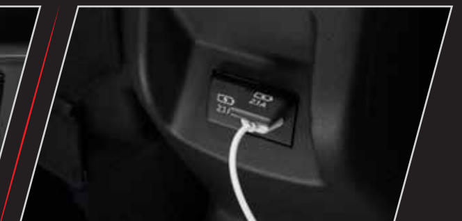
Rear USB ports*