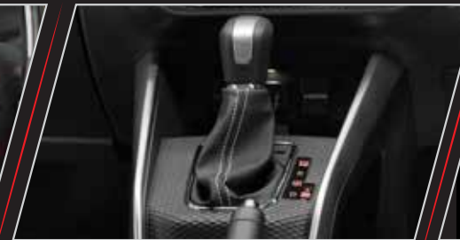
Gear Knob with Chrome