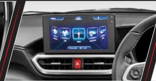
9" Display with sleek user interface