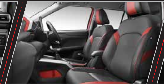
Semi-bucket Leather Seats