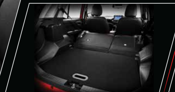
Full-flat Mode Rear Seats