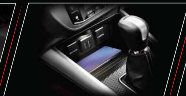
Open Tray with Illumination