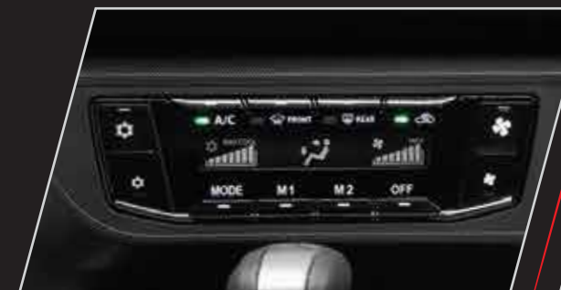
Digital air conditioner controller with quick OFF button