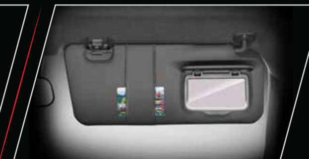
Vanity Mirror with Card Slot