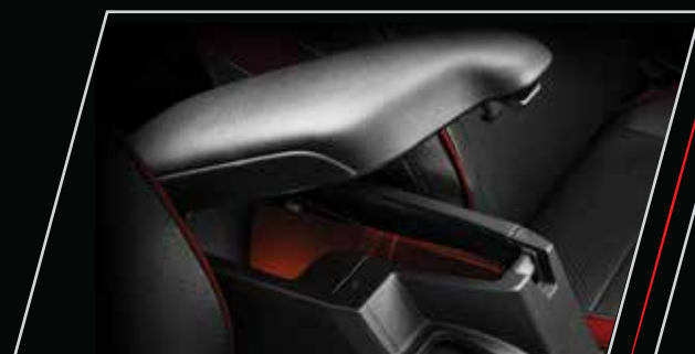
Console Box with Padded Armrest*