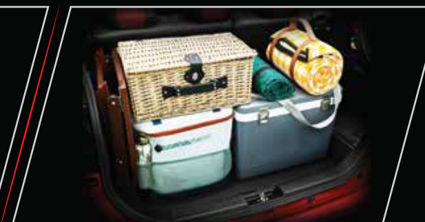
Tier 2: 369 litres