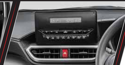
11" Radio with Bluetooth & MP3