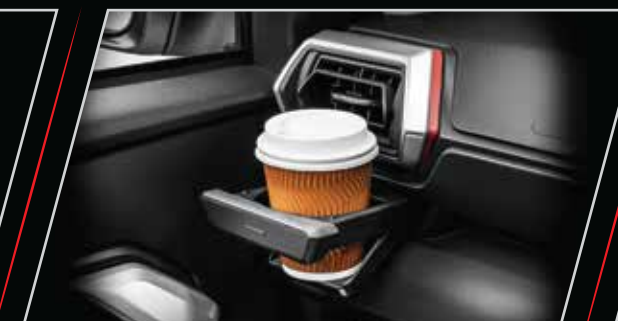
Built-in Cup Holder