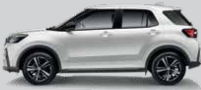
Pearl Diamond White**