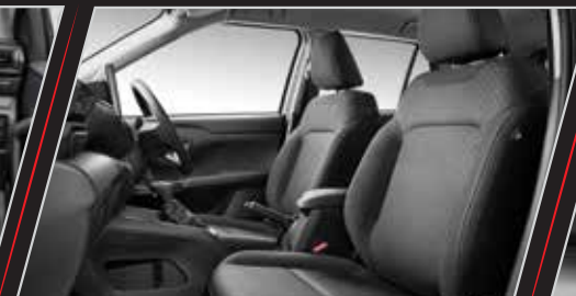
Semi-bucket Fabric Seats