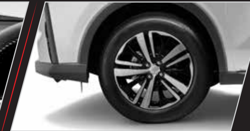
17-inch Alloy Wheels (5-spoke)