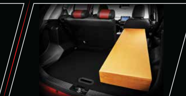
60:40 Split-folding Rear Seats