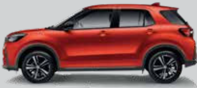
Pearl Delima Red**