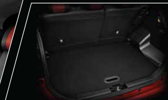
Tier 1: 303 litres