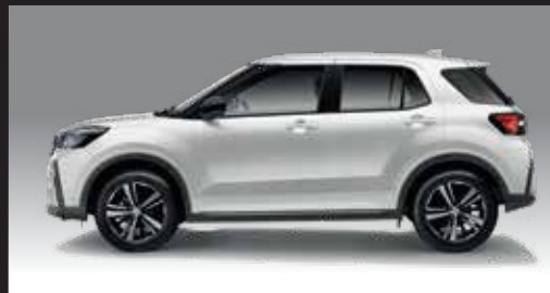
Differences from X